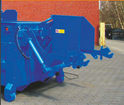
Attached bin tipper for 660-1,000 l waste containers (MGB)