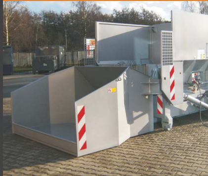
Attached bin tipper with loading shovel