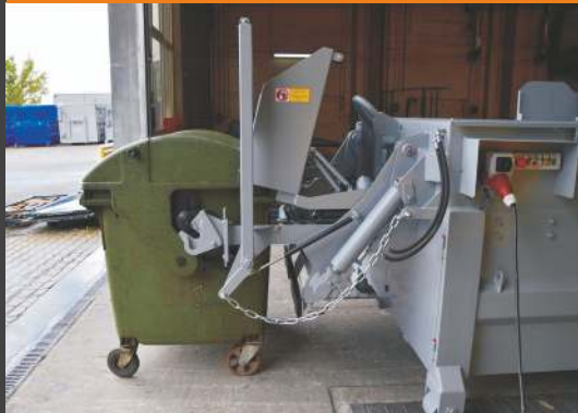
Attached bin tipper (HKV) for 2x240 l or. 1x 660-1,100 l waste containers (MGB) with automatic lid opener