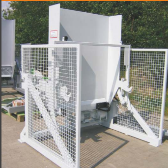
Stationary bin tipper for 660-1,100 l waste containers (MGB) with autom. lid opener