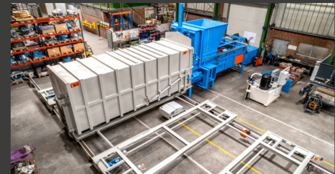
CONTAINER TRAVERSING SYSTEM