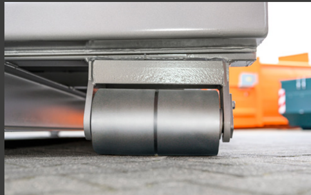
ROLLERS MADE OF POLYAMIDE

These rollers are easier to replace if they show signs of uneven wear. This means that only the worn part needs to be replaced, which makes maintenance easier