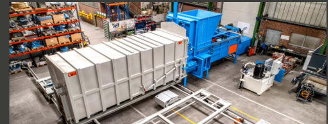
CONTAINER TRAVERSING SYSTEM

Further additional equipment is available on request.