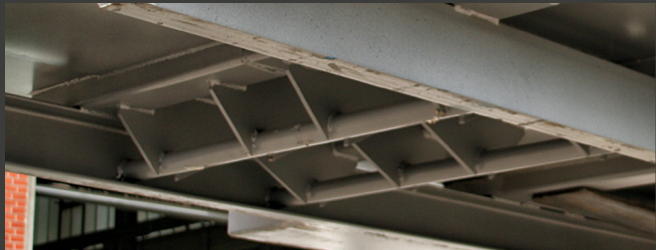
THREEFOLD PIVOTING BEARING FOR L&M SKIP TYPE SYSTEM