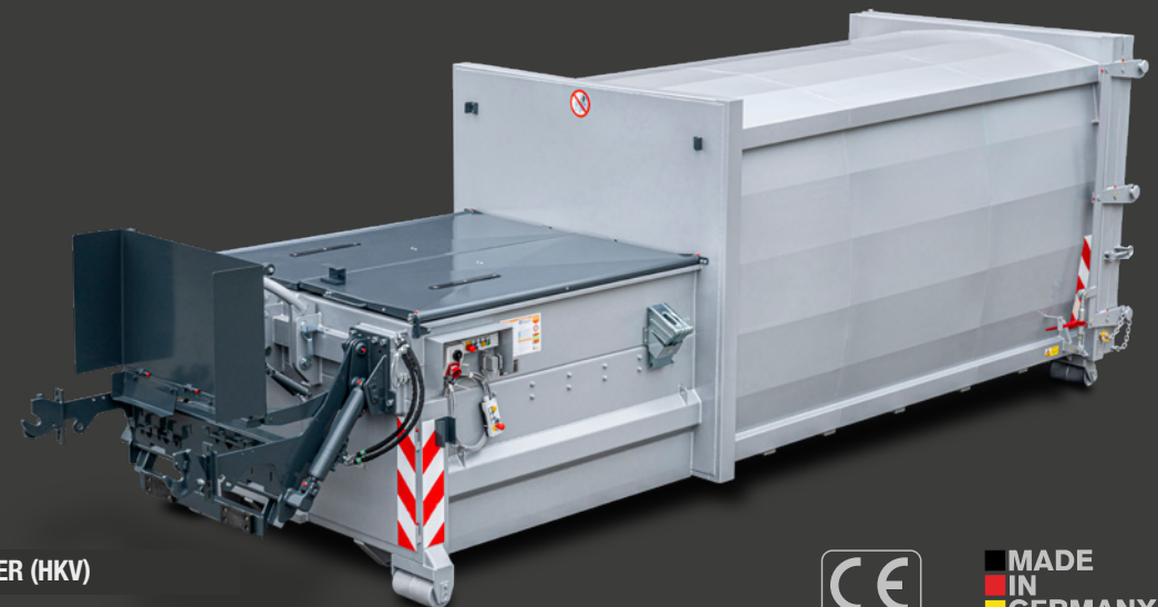
LM 20 GL WITH BIN TIPPER (HKV)