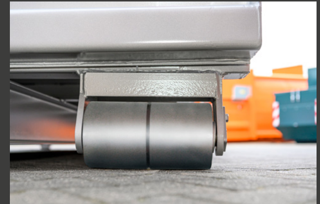
ROLLERS MADE OF POLYAMIDE 2 × 150 MM

Further additional equipment is available on request.